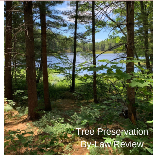
Tree Preservation By-Law Review