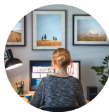
OFFICE CLOSURE & REMOTE WORK