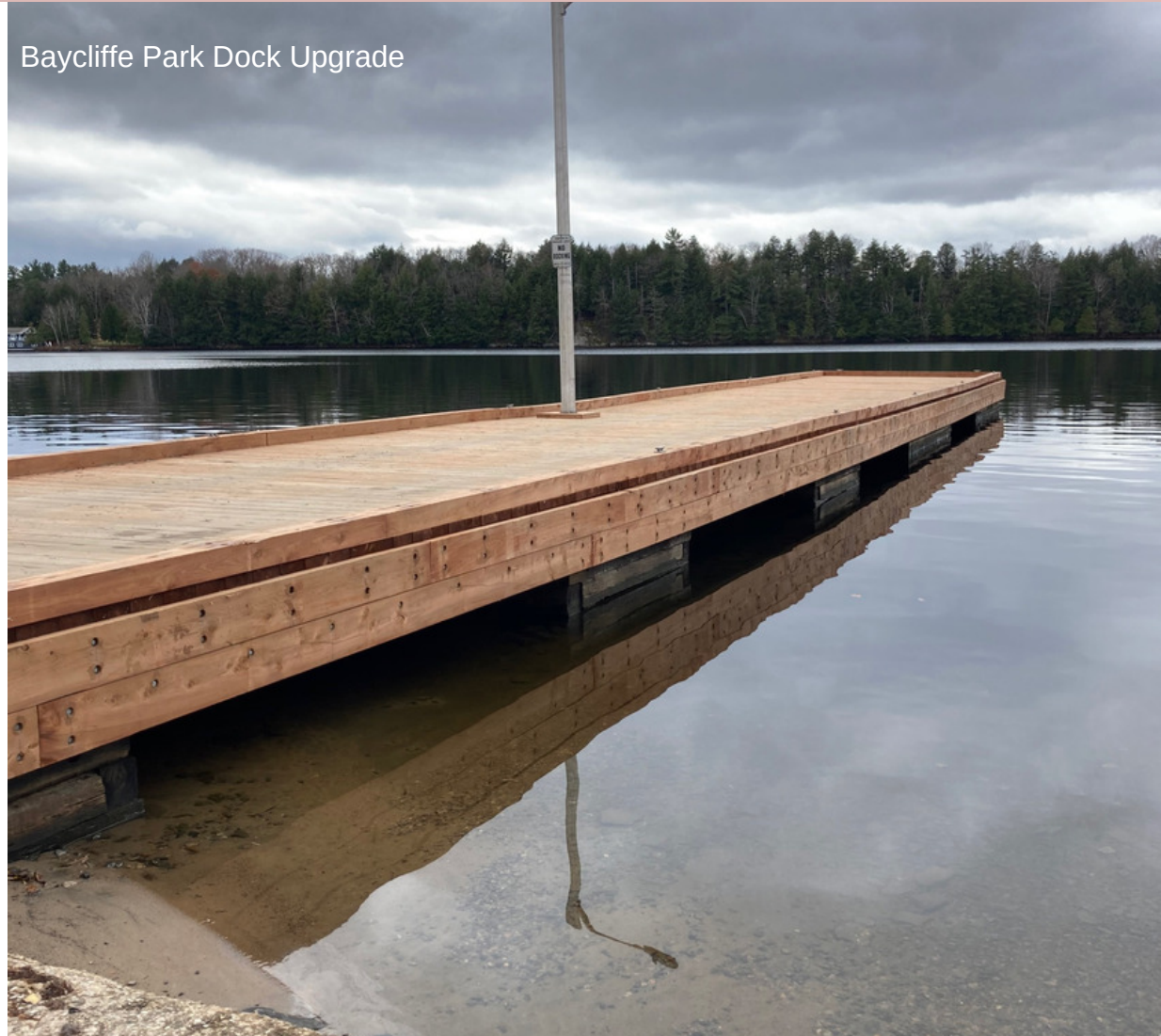
Baycliffe Park Dock Upgrade