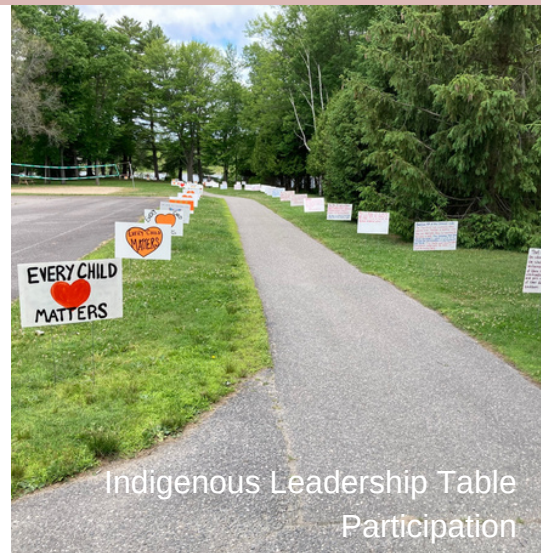
Indigenous Leadership Table Participation