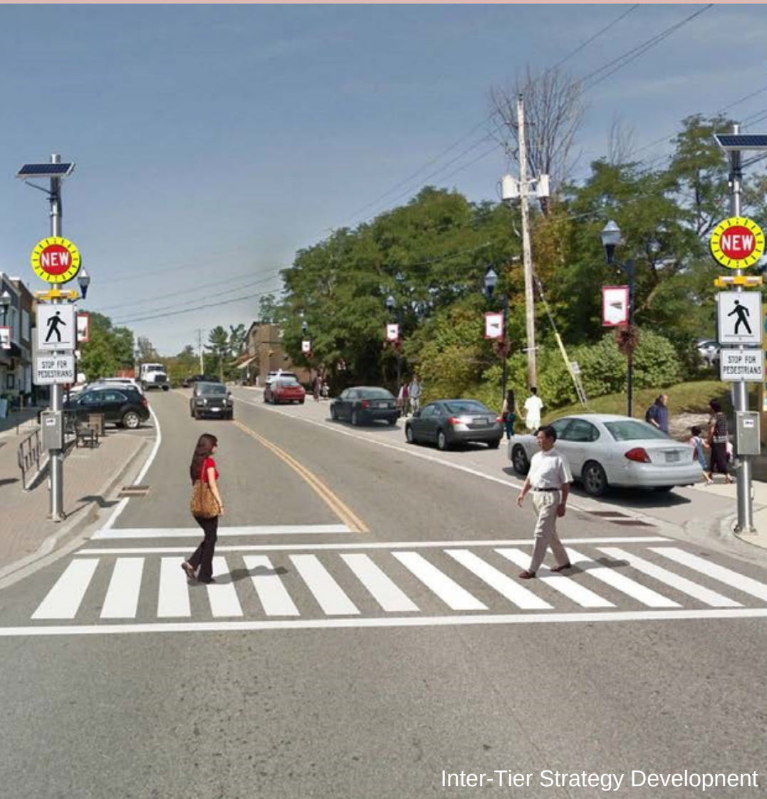
Inter-Tier Strategy Development