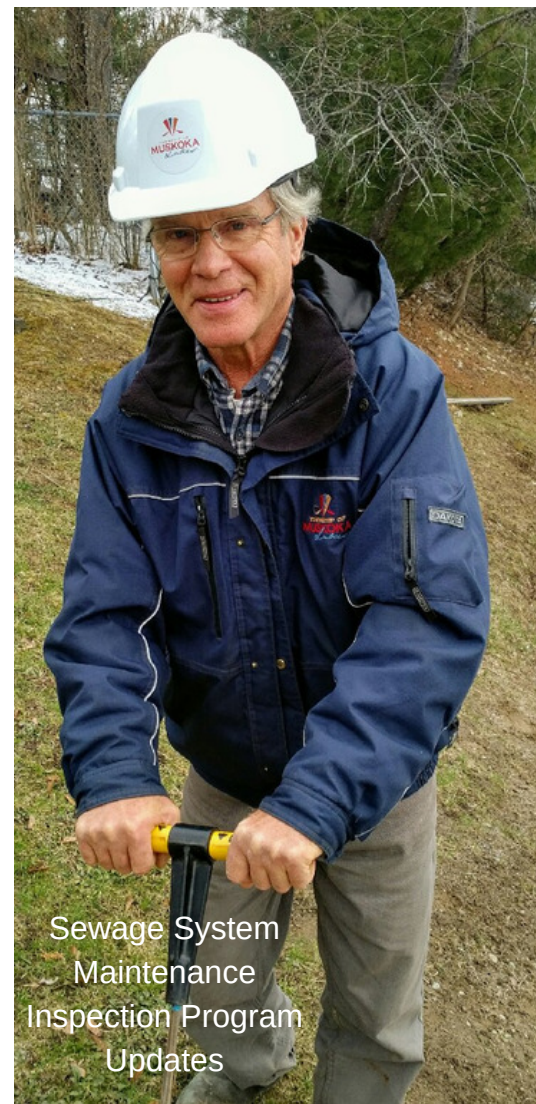
Sewage System Maintenance Inspection Program Updates