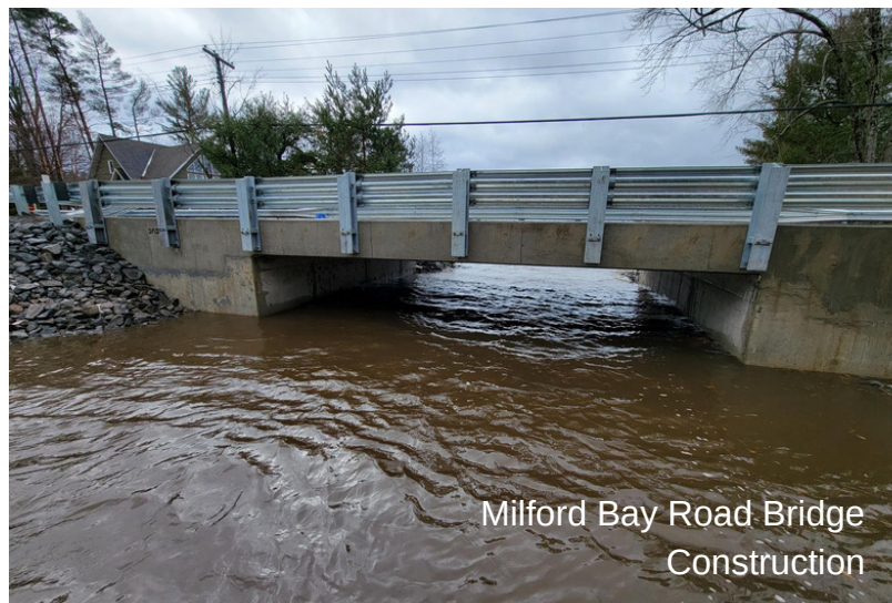
Milford Bay Road Bridge Construction