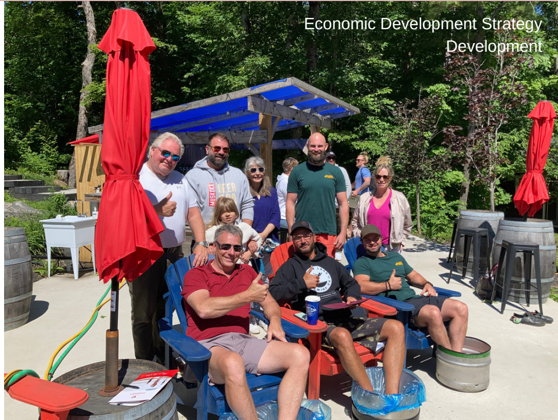
Economic Development Strategy Development