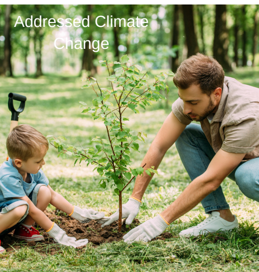
Addressed Climate Change