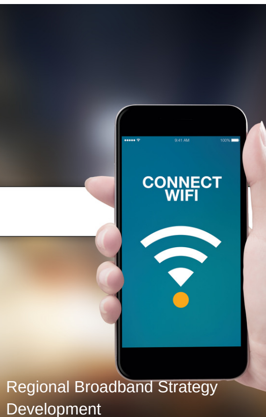
Regional Broadband Strategy Development