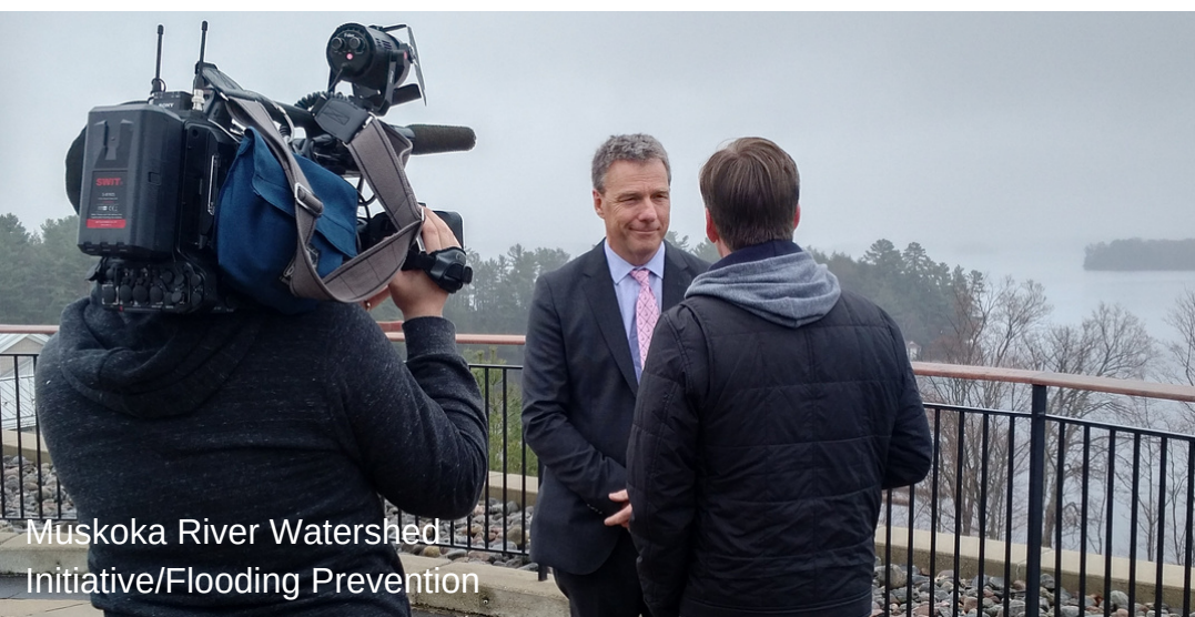
Muskoka River Watershed Initiative/Flooding Prevention