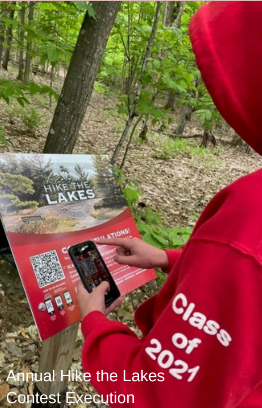
Annual Hike the Lakes Contest Execution