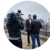
MEDIA AVAILABILITY & COMMUNICATIONS