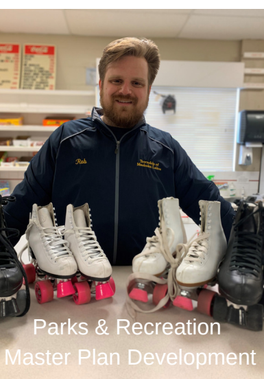
Parks & Recreation Master Plan Development