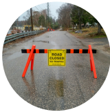
MULTIPLE ROAD AND BRIDGE CLOSURES