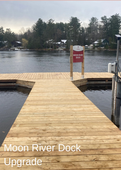
Moon River Dock Upgrade