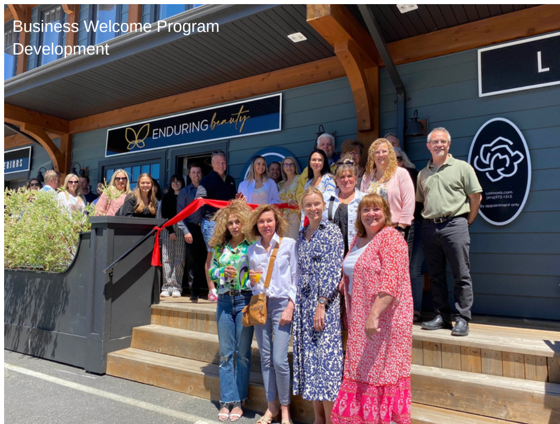
Business Welcome Program Development