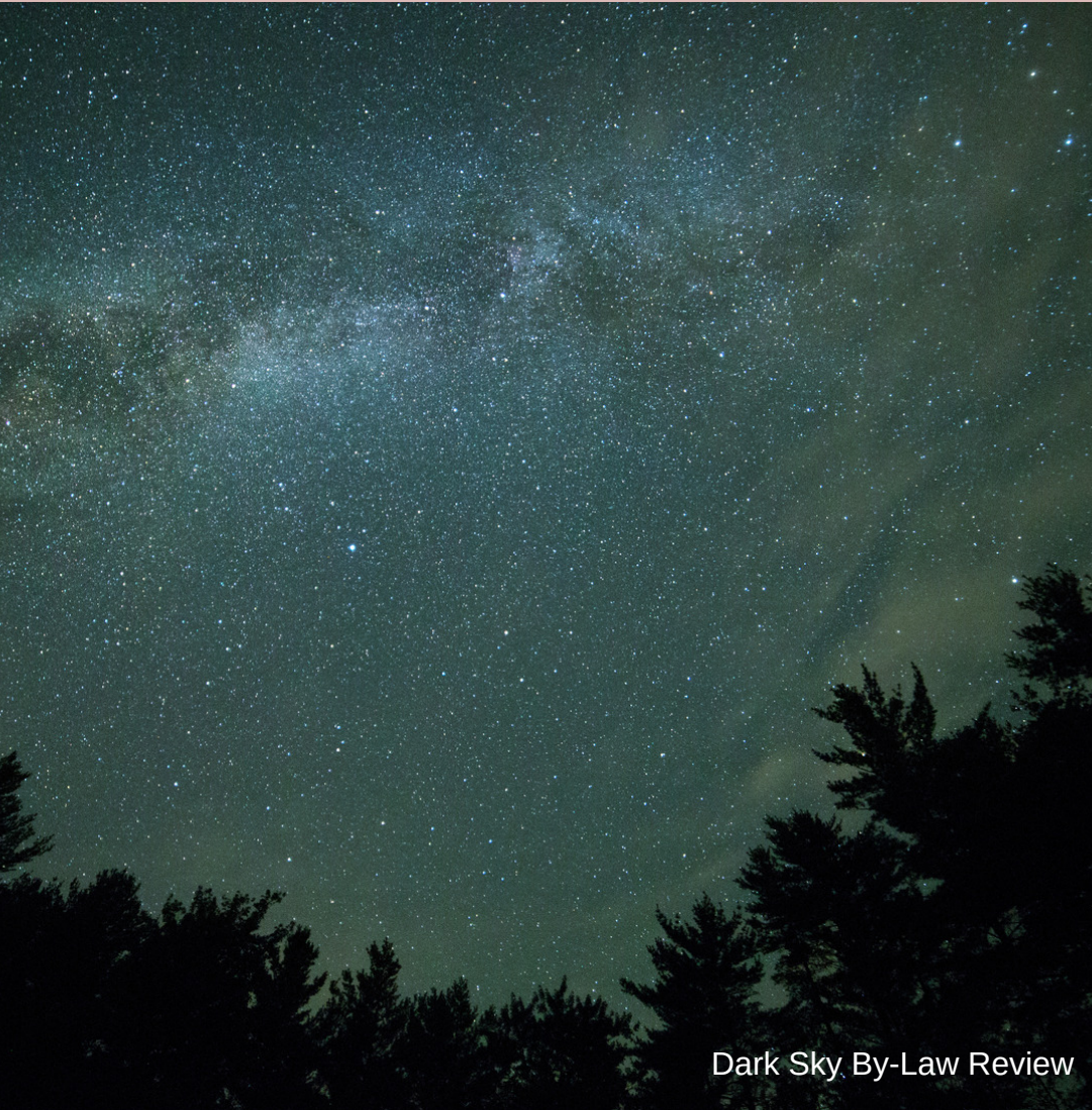
Dark Sky By-Law Review