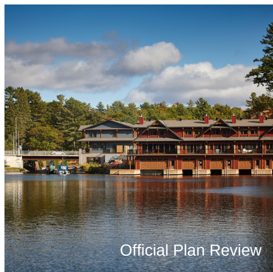
Official Plan Review