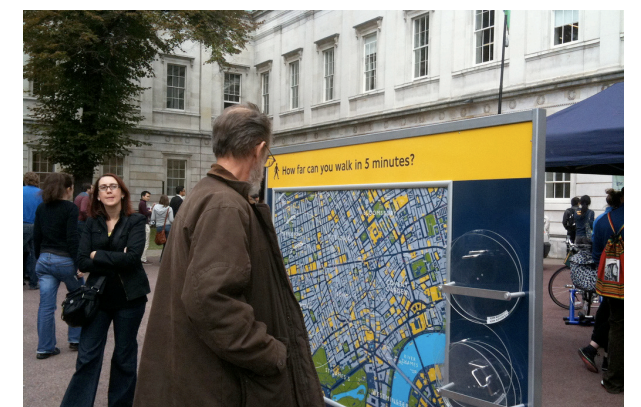
Mapping to locate parking