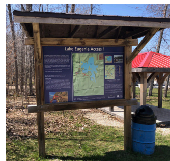
Example of Information Kiosk