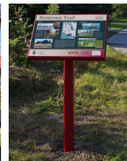
Example Interpretive Sign